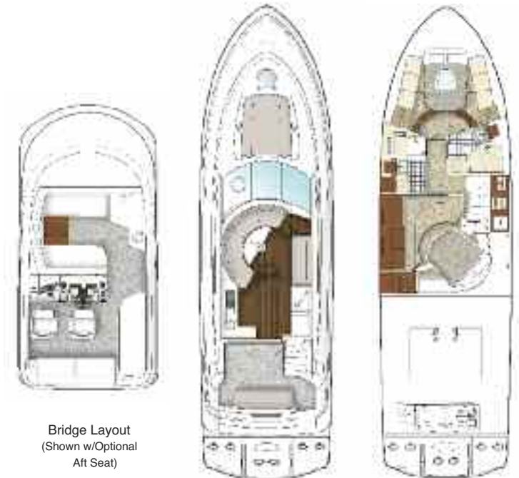
Bridge Layout (Shown w/Optional Aft Seat)

The specification measurements are approximations and subject to variance.