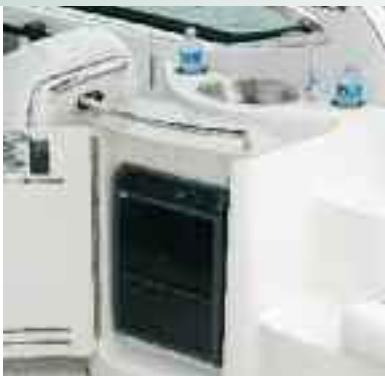
Belly up to the bar and grab a frosty drink from the optional fridge.