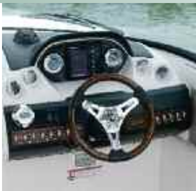
Mission control, with a standard flush-mounted GPS/chartplotter.