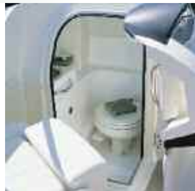
Guests will like the big head compartment when you're far from home.