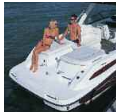
Two sun pads convert to one with a folding center cushion.