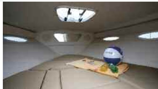
The V-berth is a bright, airy place featuring an opening overhead hatch, four portlights, and a mirrored bulkhead.