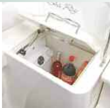
Bring all of your guests' favorites in the standard built-in refrigerator.