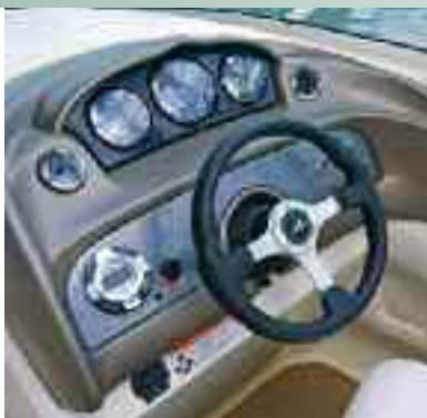
Style and substance meet in this compact, metallic-tone helm station.