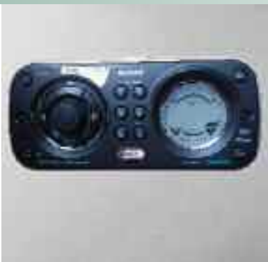
Our Sony® stereo AM/FM CD with iPod® connector