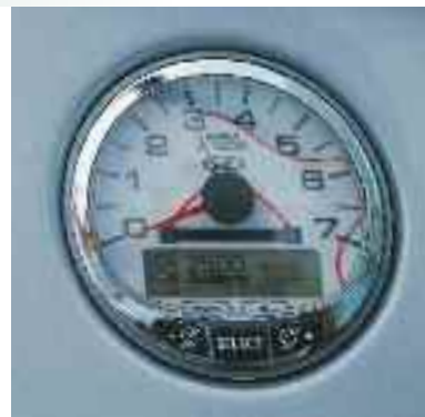
Smart Tow digital speed control is a favorite water sports feature.