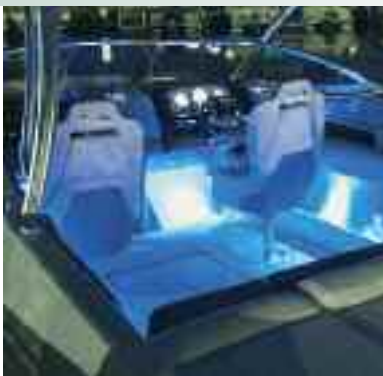
Think of the blue cockpit lights as ground effects for your boat.