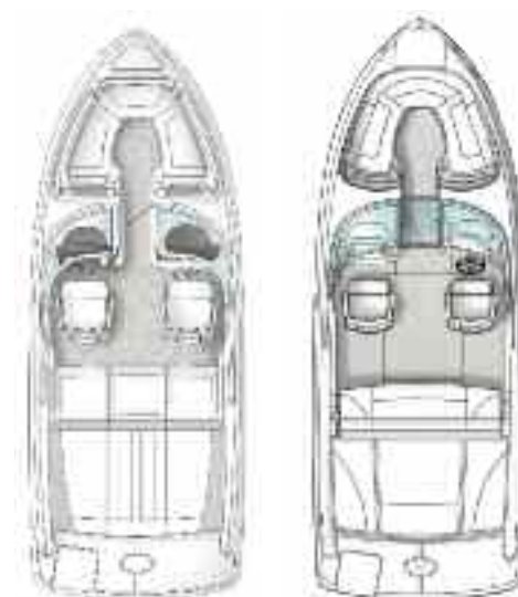
Standard Layout 210

The specification measurements are approximations and subject to variance. Some equipment shown may be optional and/or not CE -certified. Options and colors shown may not be available on current model-year product.