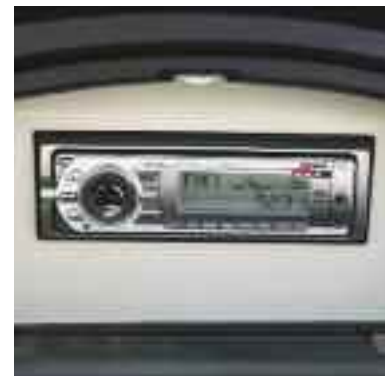
A Sony® stereo unit with CD player will keep the tunes coming all day long.