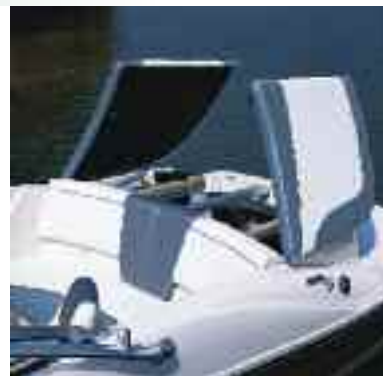
Open wide and check out the potent MerCruiser® engine, then say "ah!"