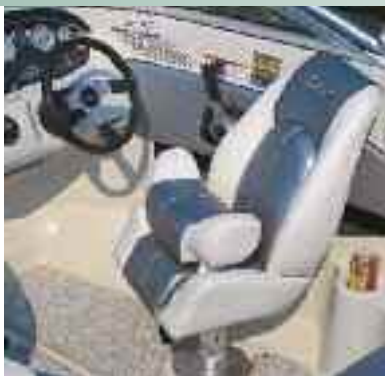
Drive seated or standing, it's your choice with the optional flip-up bolster.