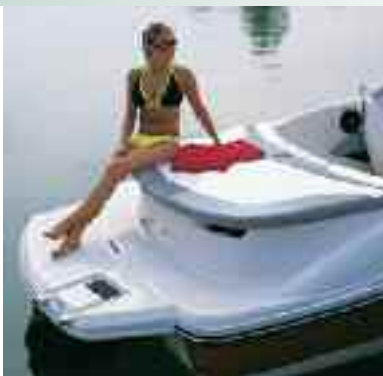
Stretch out on the lengthy sun pad and extended swim platform.