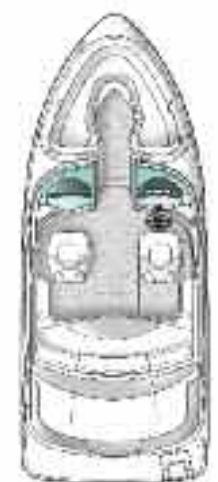
Optional Layout B