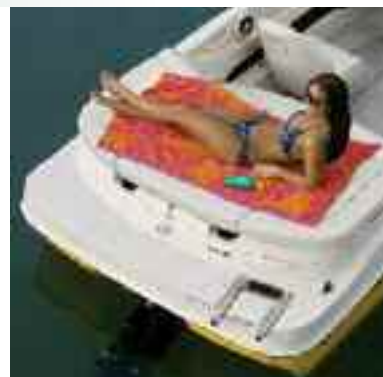
The optional sun pad provides more than enough room to stretch out and soak up some rays. (Layout B)