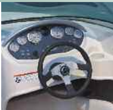
Power assisted steering means smooth and strong maneuvers.