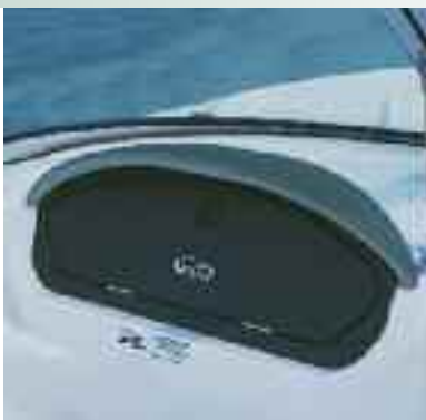
A lockable glove box protects your goods, including the standard Sony® stereo with CD player.